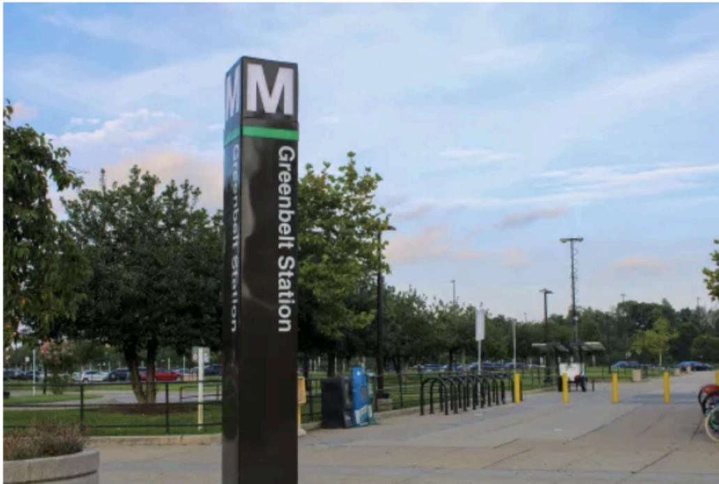
The selected site for a FBI headquarters in Greenbelt, a parking lot next to the Greenbelt Metro Station.